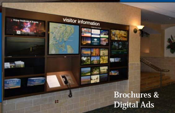
Brochures & Digital Ads