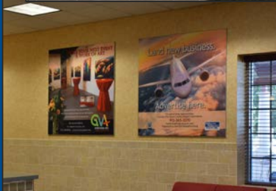
New Tension Fabric Panels